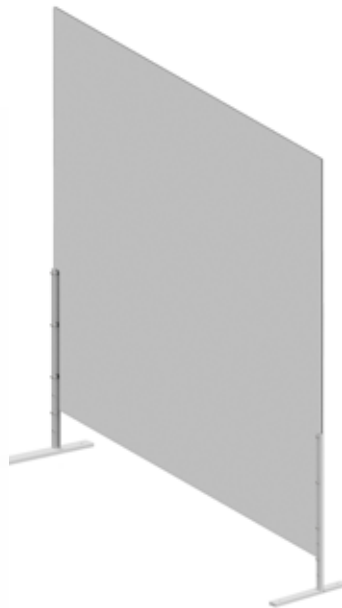
Plexi Size WxHxD 50cm x 75cm x 4mm